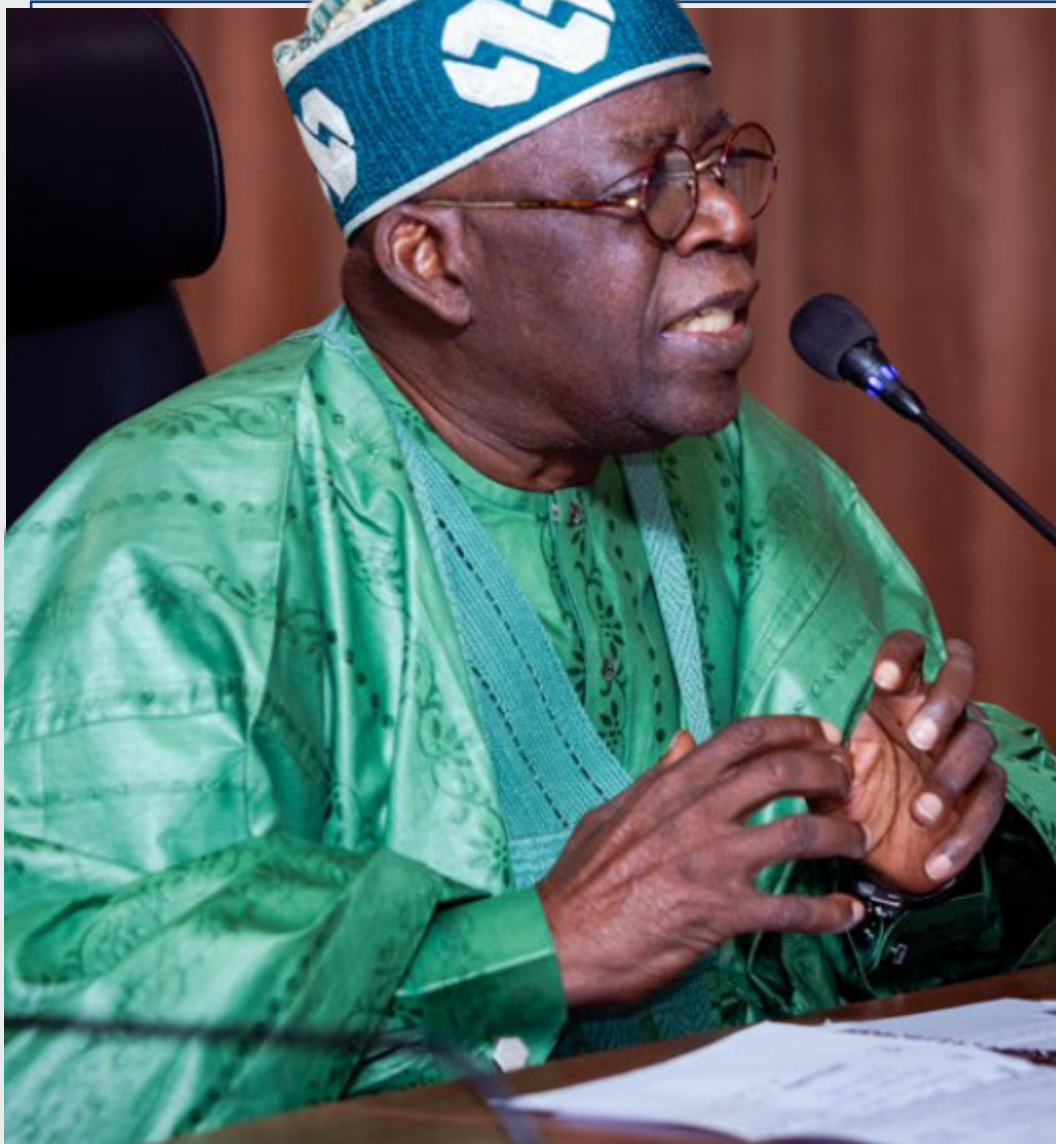
Asiwaju Bola Ahmed Tinubu